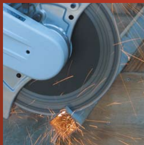
Steel and More.